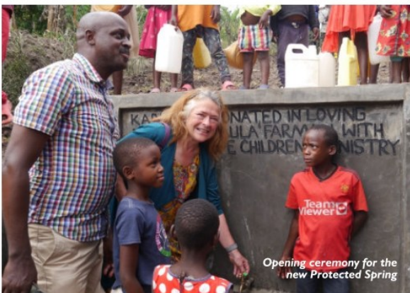
Opening ceremony for the new Protected Spring