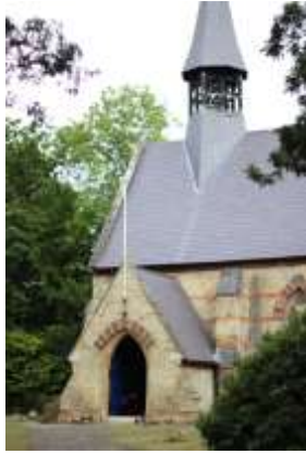
St John's C of E Church (Clay Hill)

England School, most of our RE is Christian and in accordance with the Church's doctrine but major world faiths are studied during some topics.