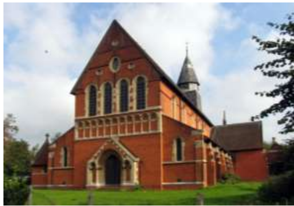
St Luke's C of E Church (Browning Road)

Daily acts of worship are an important part of the life of the school. The Head, Deputy Head teacher, Assistant Head teacher & class teachers lead our worship. On Fridays we have our Celebration Assembly with a collective worship when the children's good work and efforts are acknowledged and praised; all parents are welcome to attend this assembly.